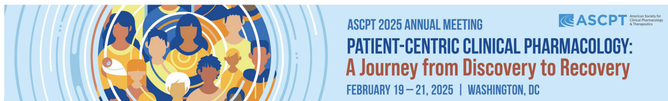
Figure 1 Graphic of the ASCPT 2025 annual meeting theme.